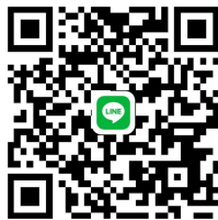
Via Line App